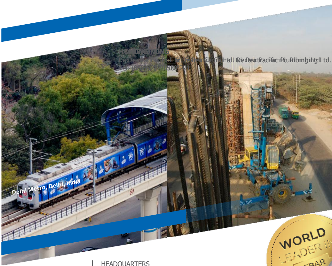
Delhi Metro, Delhi, India

© 2012 Dextra Building Products (Guangdong) Co., Ltd. & Dextra Pacific Plumbing Ltd. All rights reserved.