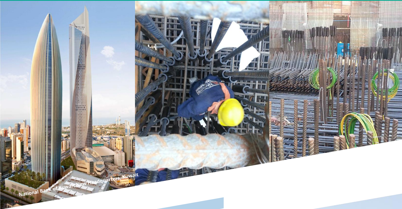
National Bank of Kuwait New Headquarters, Kuwait