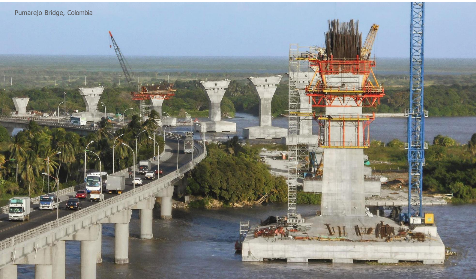
Pumarejo Bridge, Colombia

Note: The information in this catalogue is considered up to date at the time of publication. We reserve the right to make technical and design changes at any time. Dextra shall not accept liability for the accuracy of the information in this publication or for any printing errors.