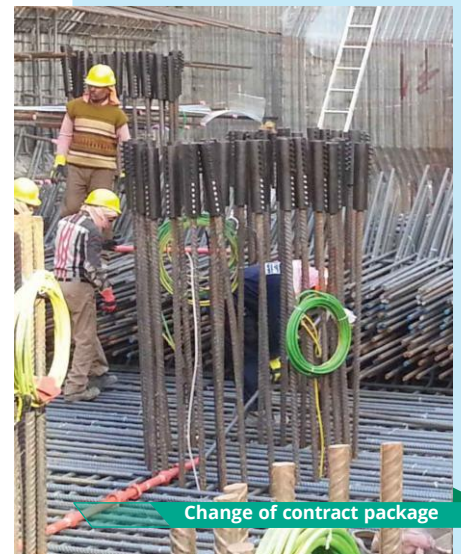
Change of contract package