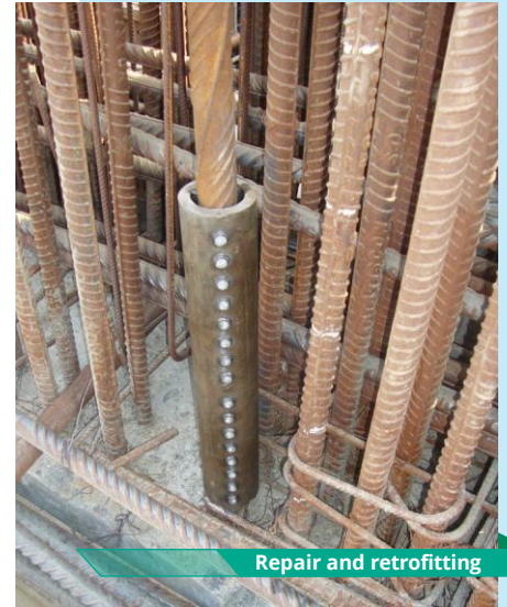
Repair and retrofitting